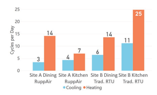
Average Equipment Cycles per Day