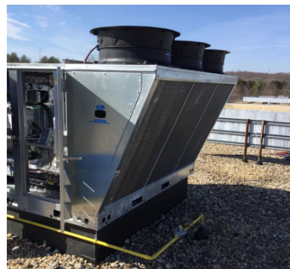
Installed DOAS at the Laboratory